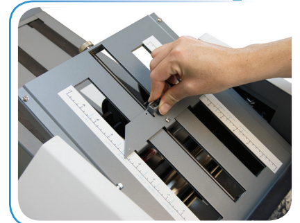
Pre-marked adjustable fold plates